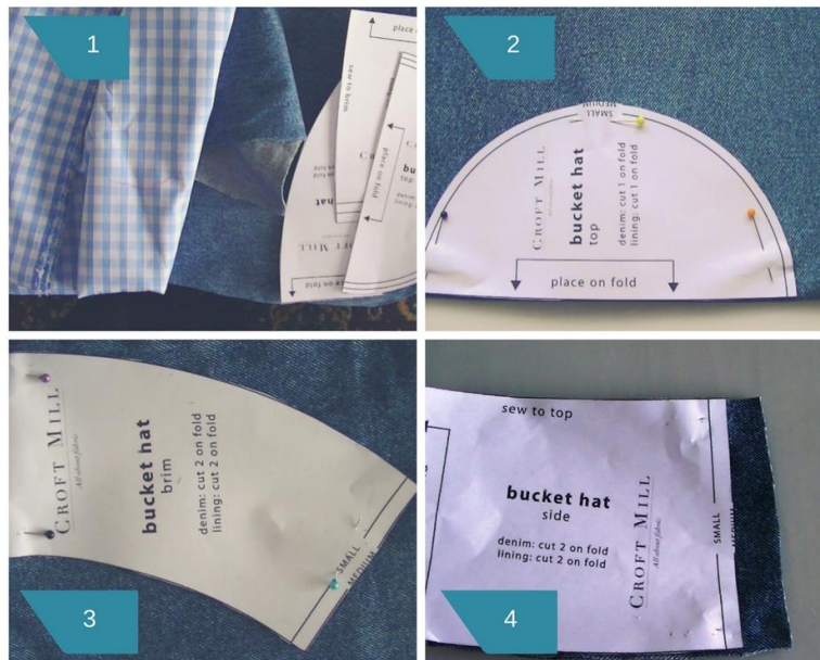
Croft mill bucket hat pattern